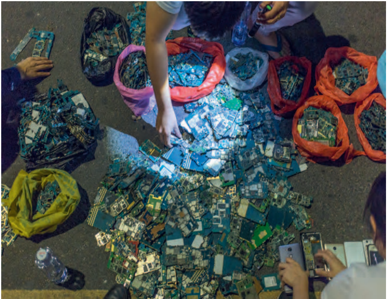
Figure 1.5 Crowds take over Aihua Road, [year] / Devices in various conditions re-entering circulation through the ghost market.