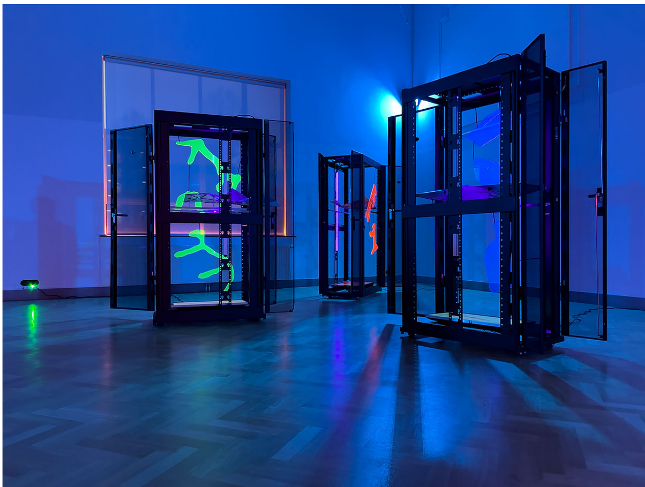
Figure 1.3 Mountain Stronghold, Dennis de Bel, [materials], 2022