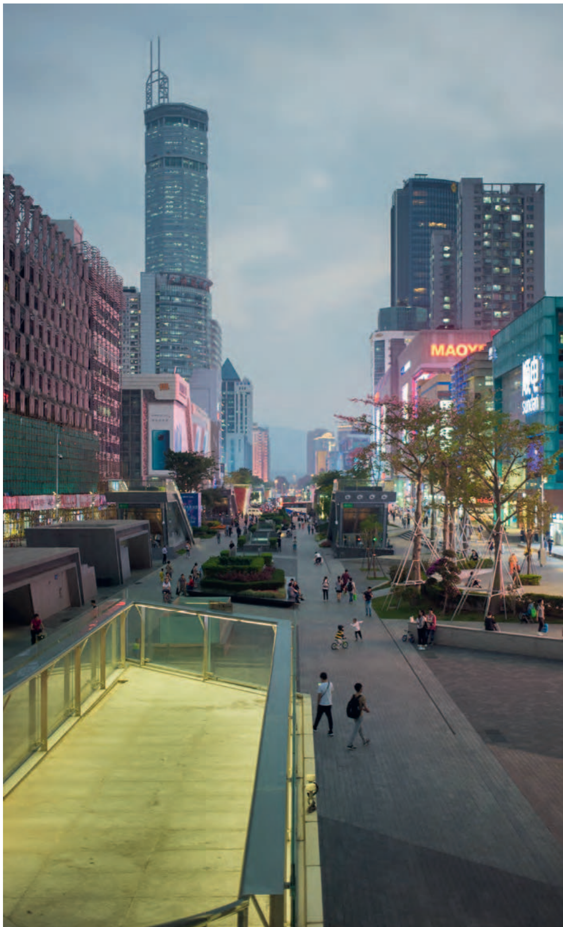
Figure 1.4 Huaqianbeipedestrian Street, [year] / The renovated Huaqiangbei Pedestrian Street, sporting several elevated points of interest.